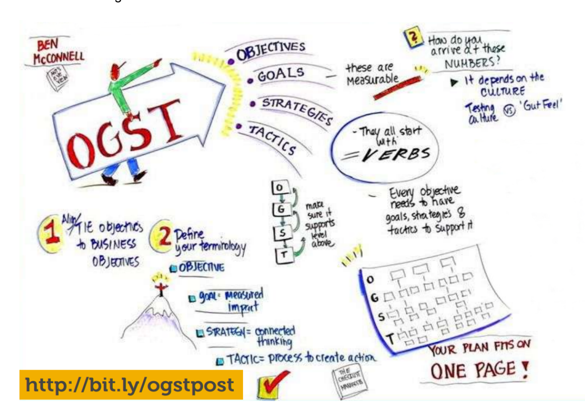
Figure 5: An illustration of the OGST framework

The widely used OGST planning framework, with a discussion and examples of each level: Objectives, Goals, Strategies, and Tactics (illustrated in Figure 5). Additional tools/exercises were mentioned including SWOT (Strengths, Weaknesses, Opportunities, Threats), Start/Stop/Continue, and the use of a Skills Matrix for RCD organizations.